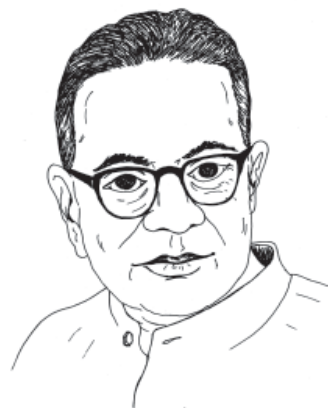
T.T. Krishnamachari CAD, Vol. 7, p. 234

Let me tell my honourable friends in the House that the drift ..... in all constitutions has been towards the centre.. ... because of circumstances that have now come into being that states have become, whether ..federal or unitary, welfare states from being police states and the ultimate responsibility as for economic well being of the country has become the paramount responsibility of the Centres.