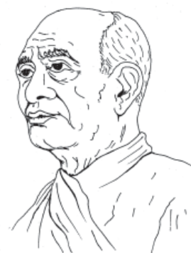
Sardar Patel CAD, Vol. VIII, p. 272.

"But in the long run, it would be in the interest of all to forget that there is anything like majority or minority in this country and that in India there is only one community..."